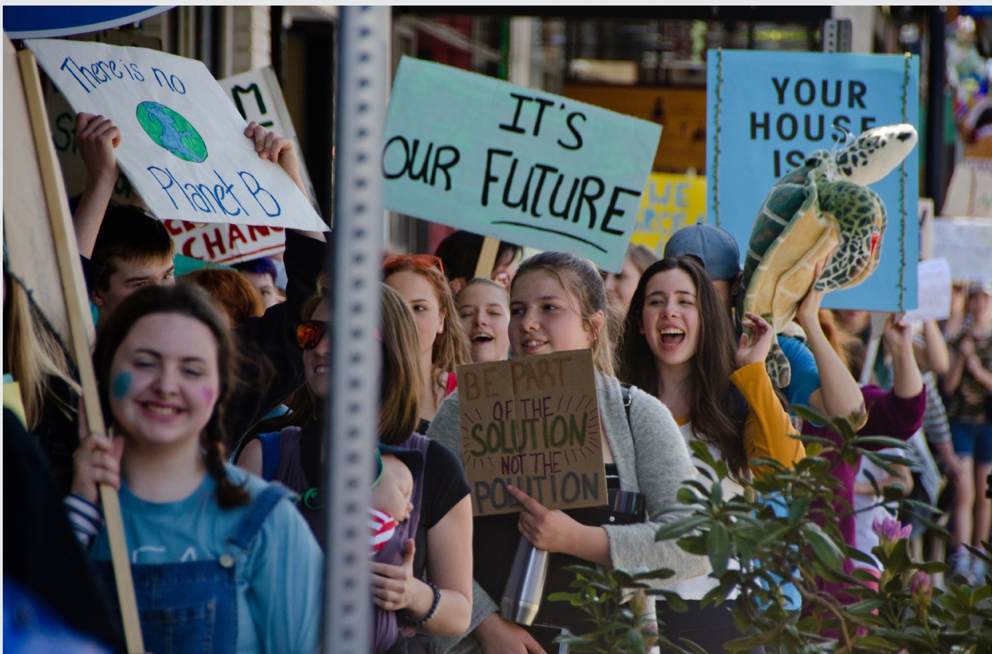
High school students participating in a climate march in Courtenay.